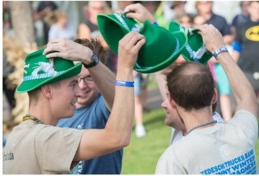
HAPPY HOUR GAME