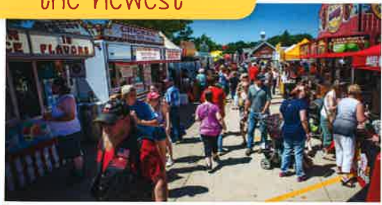
THE MAIN EVENT CHEW & BREW the newest

Today the Mandan Progress Organization boasts a membership of businesses and citizens and coordinates such events as "Touch a Truck", Buggies-n-Blues, Mandan Rodeo Days, Art in the Park Festival, July 4 th Parade, the "Main Event Chew & Brew, Oktoberfest, Santa's arrival and Small Business Saturday along with business socials and Community Cleanup Day.