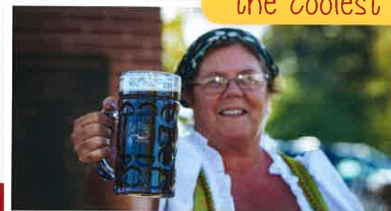
OKTOBERFEST the coolest

Mandan Bucks are gift certificates redeemable for services or products at any Mandan Business willing to accept them. Mandan Bucks may be purchased at the Mandan Progress Organization office and make a great gift idea.