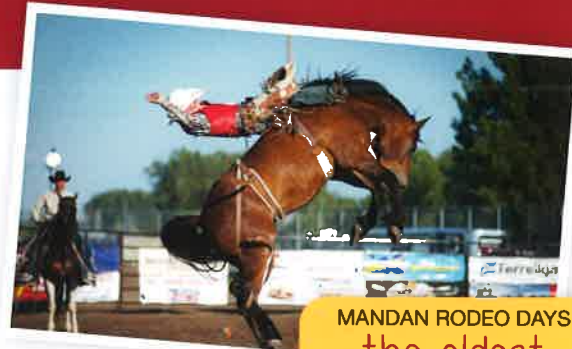
MANDAN RODEO DAYS the oldest